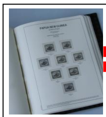
PAPUA VARIETIES (1908-1911) SUPPLEMENT