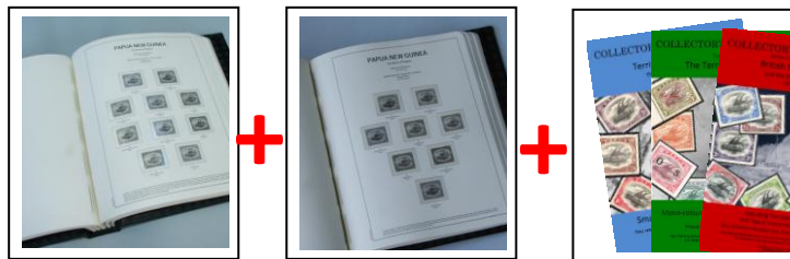
BASIC ALBUM Territory of NG, Papua & P&NG (88 pgs)